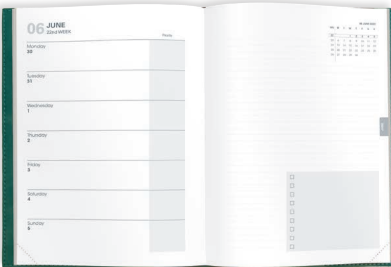
NOTE 21 - 6" x 8 1/4" (15 x 21 cm)