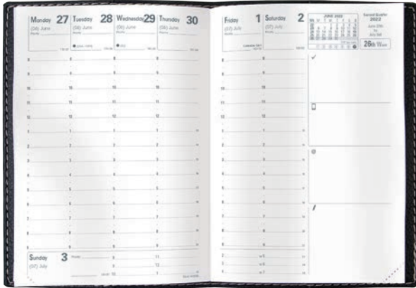
UNIVERSITY - 4" x 6" (10 x 15 cm)

Both the Academic Minister and the University include annual planning pages, daily 8am to 9pm schedules, priority boxes, and space for contacts, but the Academic Minister also features monthly planning pages, three monthly calendars on each spread instead of one, and 90g paper instead of 64g.