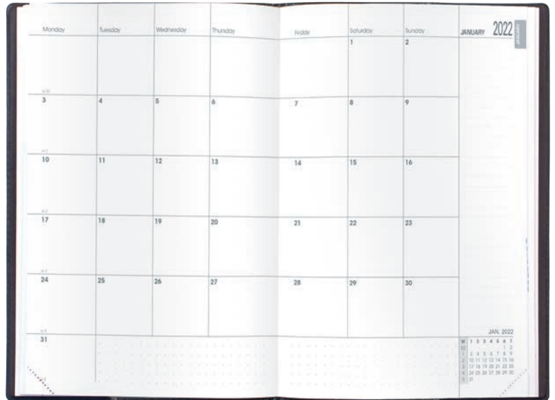
MONTHLY 21 - 6" x 8 1/4" (15 x 21 cm)