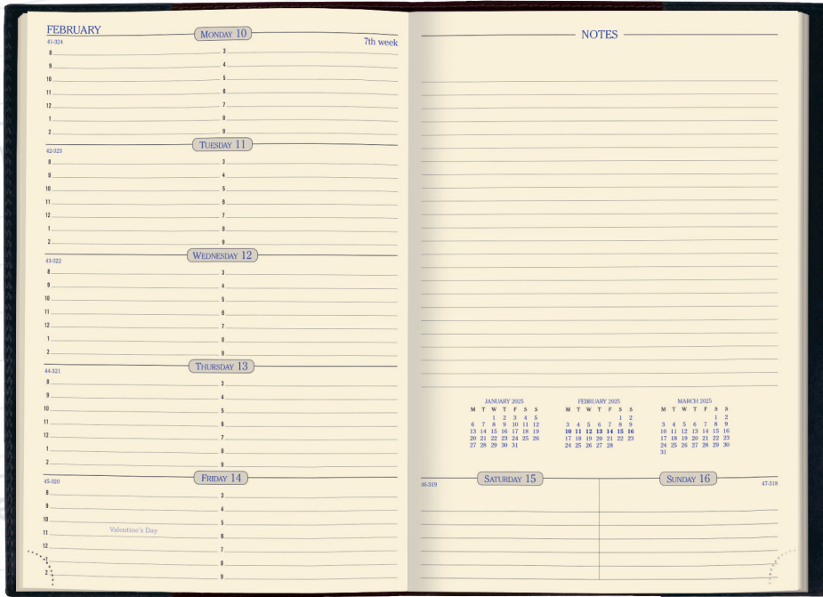
SPACE 24 - 6 1/4" X 9 3/8" (16 X 24 CM)