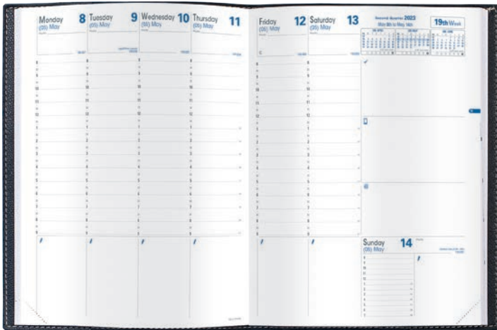
TRINOTE - 7" x 9 3/8" (18 x 24 cm)

Both the Trinote and Prenote planners include helpful features such as added space for notes, annual planning pages, and receipts and payments pages, but the Trinote is smaller.