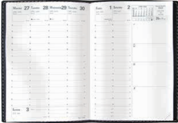
UNIVERSITY - 4" x 6" (10 x 15 cm)

Both the Academic Minister and the University include annual planning pages, daily 8am to 9pm schedules, priority boxes, and space for contacts, but the Academic Minister also features monthly planning pages, three monthly calendars on each spread instead of one, and 90g paper instead of 64g.