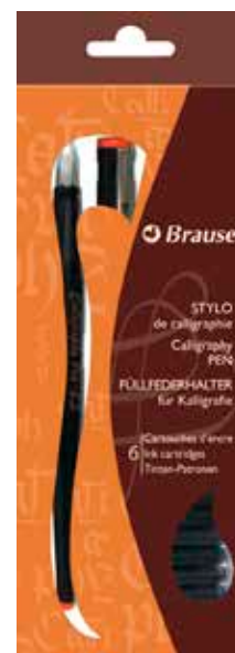
B974/ Calligraphy Pen