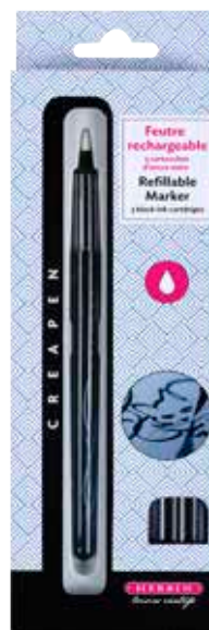
H205/20 Felt Marker