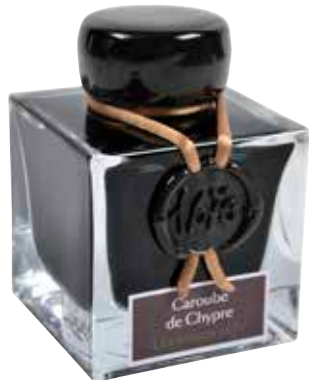
H150/45 - Caroube de Chypre