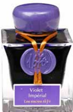
H150/76 - Violet Imperial NEW