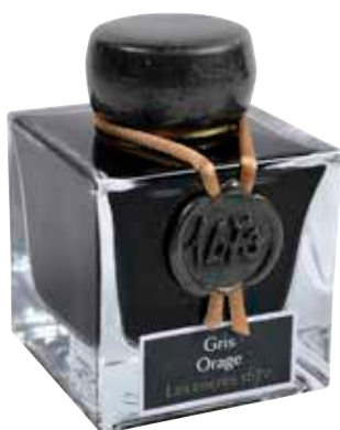
H150/09 - Stormy Grey