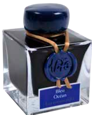
H150/18 - Bleu Ocean