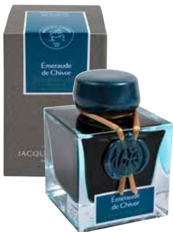
H150/35 - Emerald of Chivor

Precaution: Shake bottle well before filling your writing instrument. Frequent cleaning is recommended for maintaining your pen.