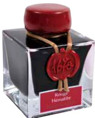
H150/26 - Rouge Hematite