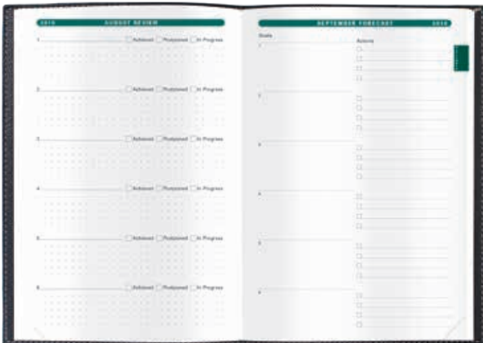
Review & Forecast each month