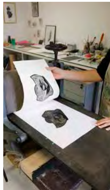
Simili Japon - 975845