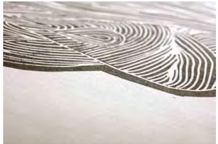
Fleur de Coton - 975055