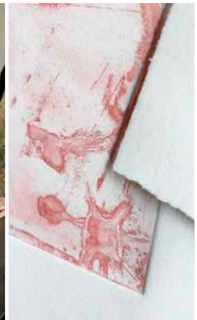
Fleur de Coton - 975055