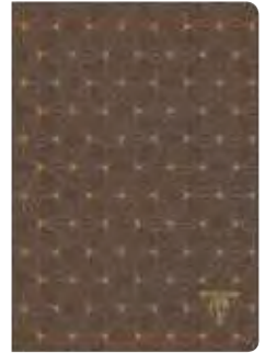
"Constellation" - #192336