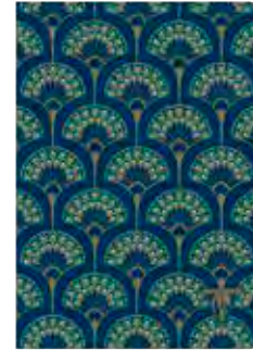
"Peacock" - #192236