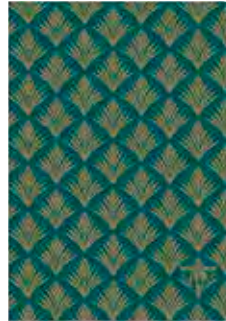
"Vegetal" - 192436