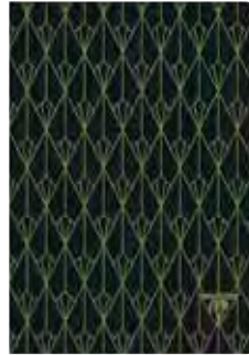
"Diamond" - 192136