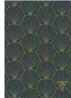
"Shell" - 192536