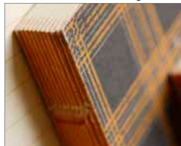
Book block binding