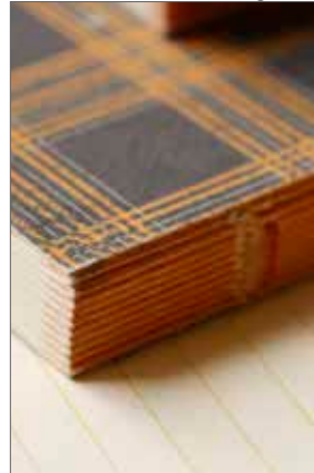
Book block binding