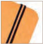
Bicolor elastic closure