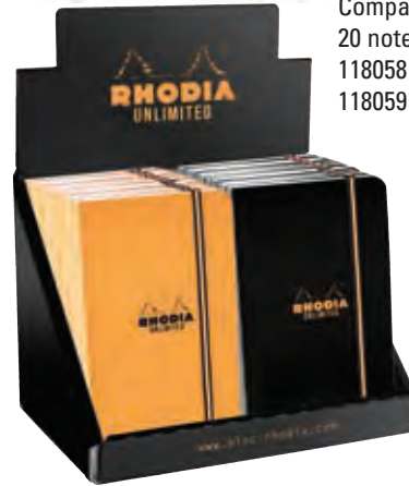
Compact display of 20 notebooks 118058 118059