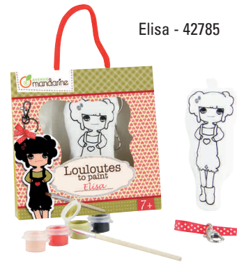
Elisa - 42785