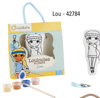
Lou - 42784