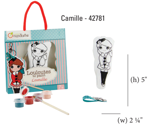
Camille - 42781