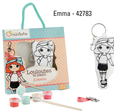
Emma - 42783