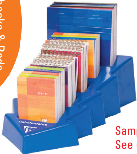
Sampler display ref. 820 See detailed assortment page 29