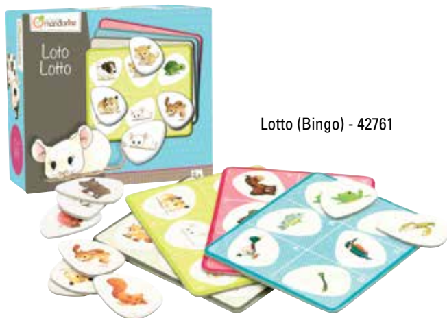
Lotto (Bingo) - 42761