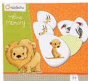
Memory - 42762